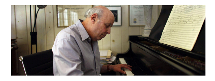
Meet the Musician: Composer Charles Fox Tue Nov 16 | 5 pm

A month-long citywide celebration, the Violins of Hope project features virtuosic performances on a collection of violins, violas, and cellos rescued from the Holocaust and restored by Israeli luthiers. Get tickets and learn more at thesorava.org/calendar/